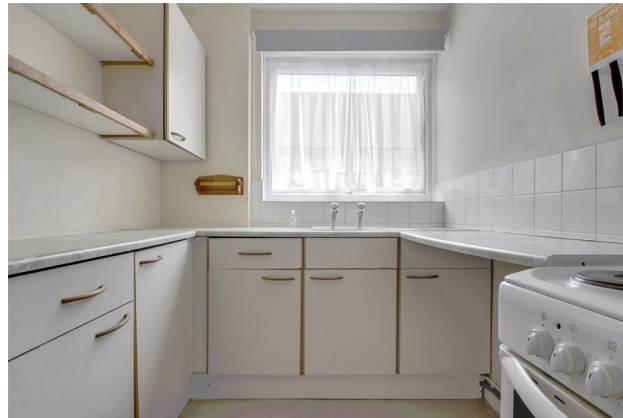
Studio Room 15'5 x 12'1 (4.70m x 3.68m)