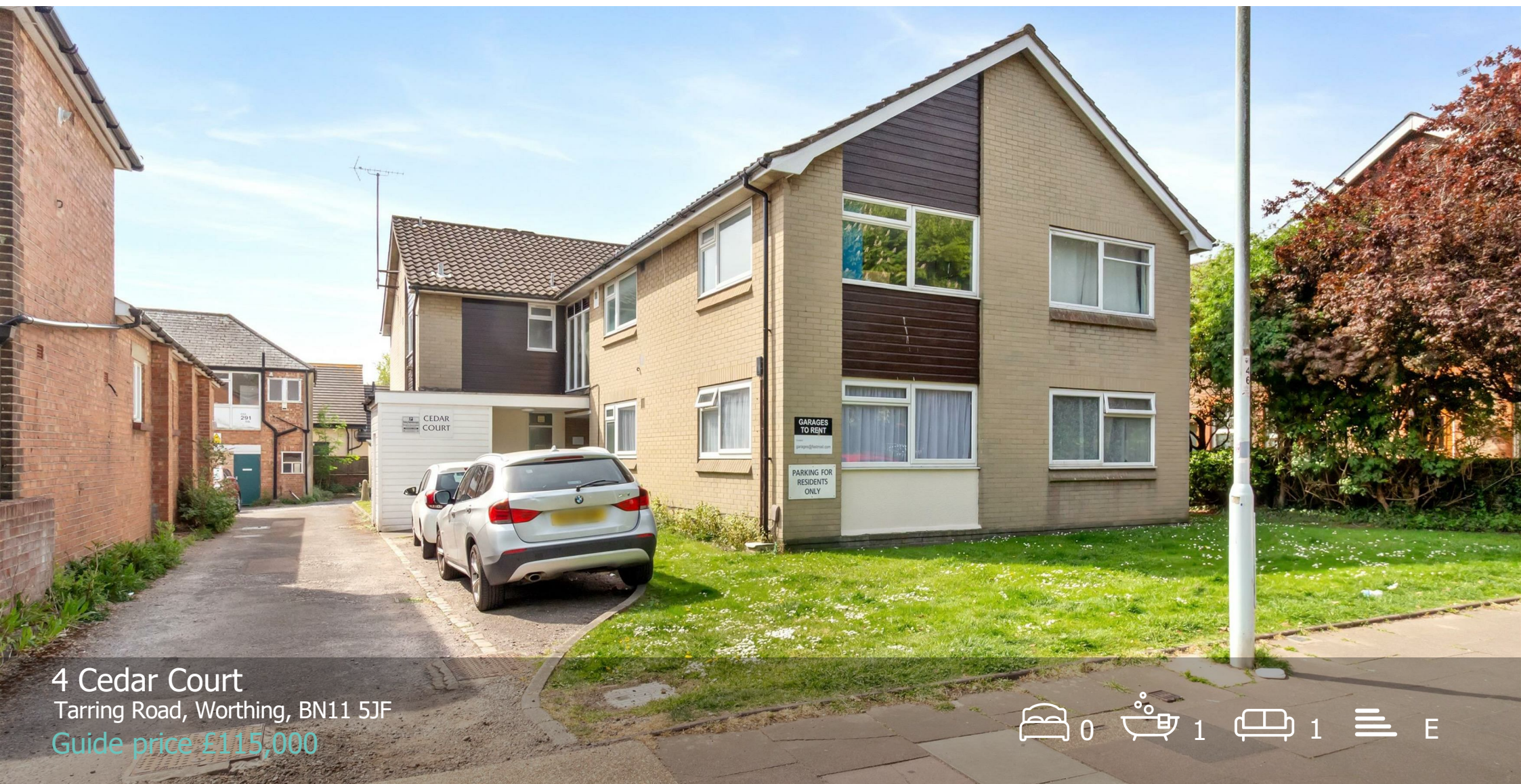
4 Cedar Court Tarring Road, Worthing, BN11 5JF Guide price £115,000